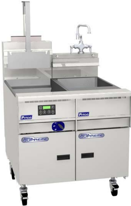
Model SSPG14/SSRS14 Shown with optional: Casters, Single Basket Lift